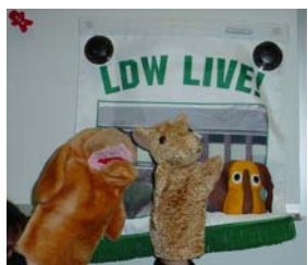
LDW Live anchors (from left) Lester, "D" & Wilson.