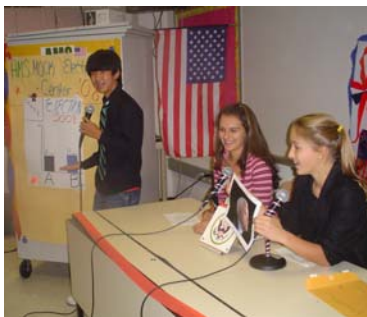
Students broadcast the results of AMS Mock Election.

Fifth and sixth grade students may also apply for a variety of sup-