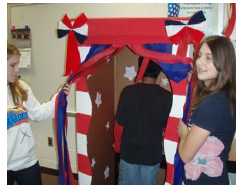
8th graders help a 6th grade student cast his vote.

The Election results were then broadcasted live over the school's internal TV station.